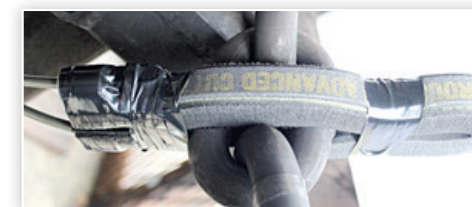
600 gr/ft Scissor Charge